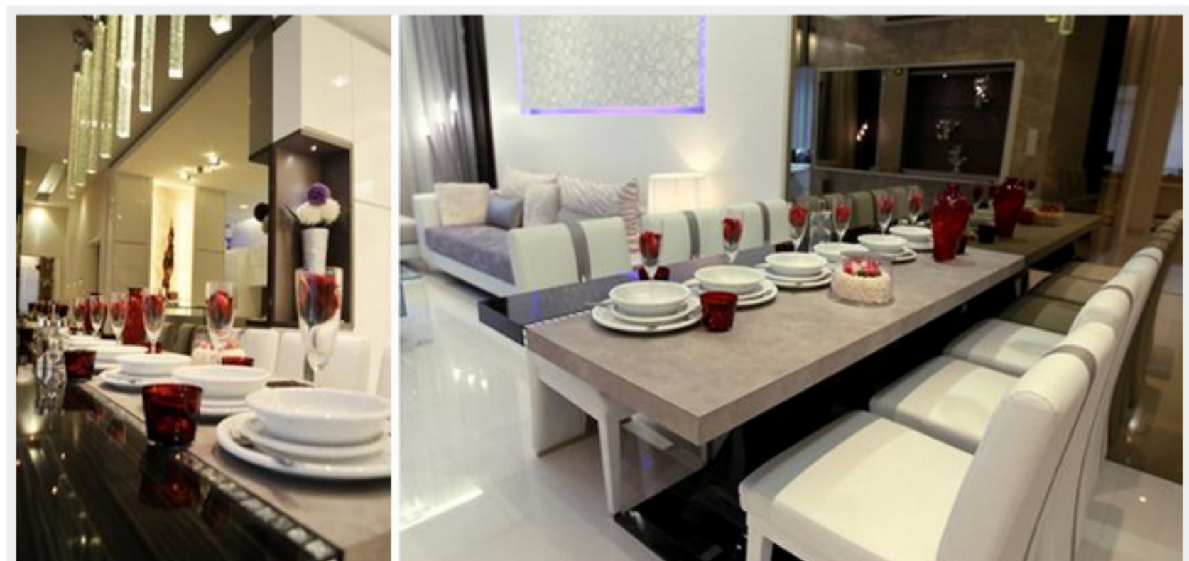
The dining area

Mirrors are also used in the dining area. "Mirrors make the area look more spacious. We got lights that have vertical strips and we measured the distance of each light to make sure it's equal when seen from the mirror. Now when you look at the mirror, it looks like one straight line. Automatically, it gives you the visual that the area is much bigger than it actually is," said Chan.