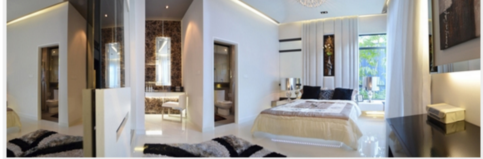
The master bedroom comes with a vanity area as well as built-in cabinets.

The room boasts a television console-cum-full height cabinets. "Behind the console, we've designed a wardrobe where we added in shelves for extra storage. We try to utilise all the space possible. Behind the television, there's a storage place to put perfume or any other personal belongings."