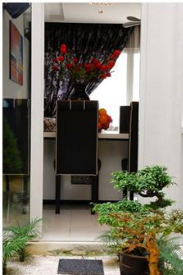
Favourite areas: Encased Japanese garden in the middle of the house (left) and L-shaped mirror plastered onto the wall and ceiling